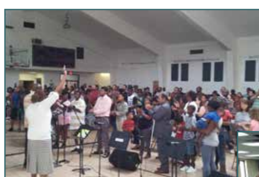
Church Service at Calvary Chapel Word of Life