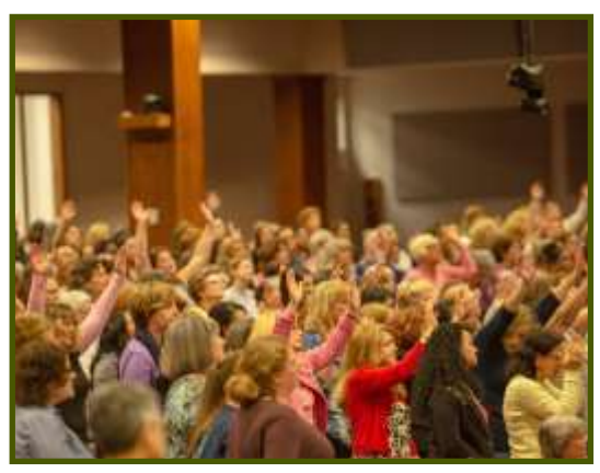
Worship from a previous Women's Seminar