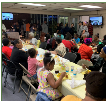
Saturday Night Service