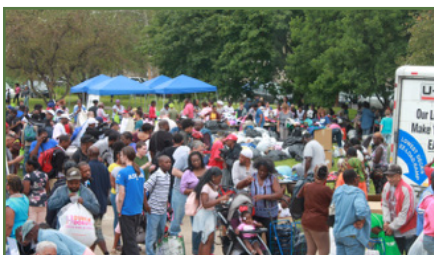
Outreach to the community