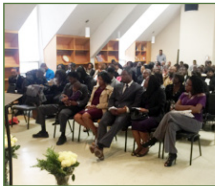
Sunday Morning Service