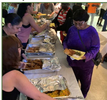
Saturday Night Service